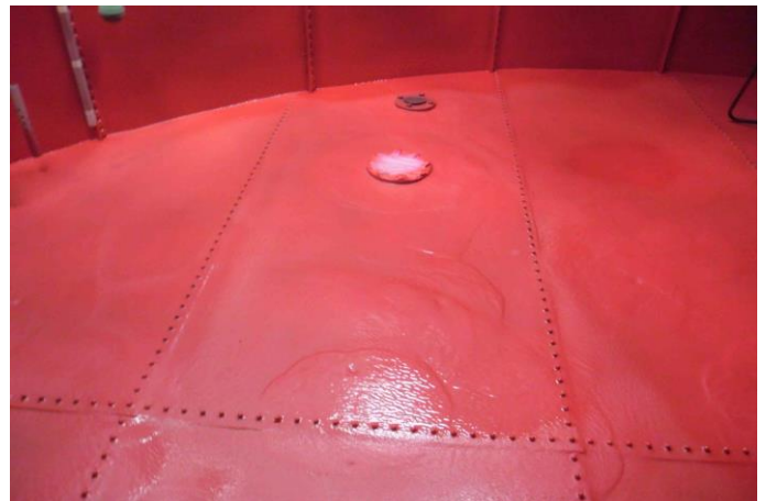
Completed Internal Liner